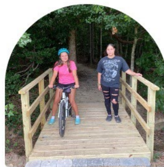
Silver Award: Bridging to Middle School