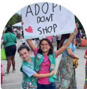
Bronze Award: Helping Shelter Pets