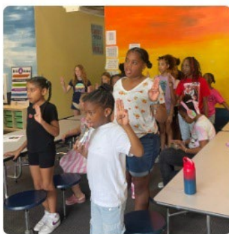
Community Troops in Newport News