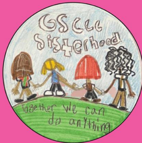
2023 First Day Patch