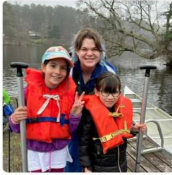
Another Beautiful Day at the Pond