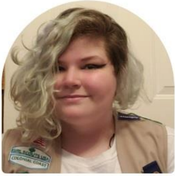
Gold Award: Adogable