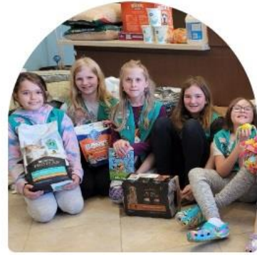
Bronze Award: Shelter Donation Drive