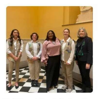
Girl Scout Legislative Day 2025