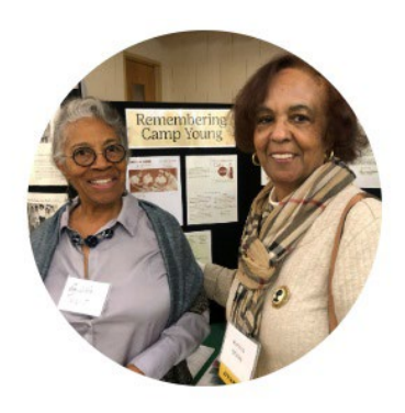
Camp Young Reunion