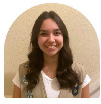
Gold Award: Crisis Boarding Program