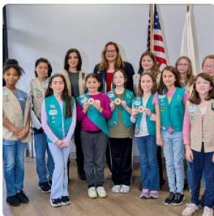
Kicking Off Girl Scout Week