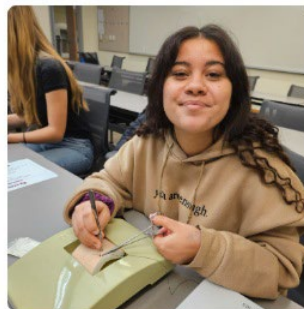
NCIS and MedSim Experience