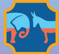
Democracy For Ambassadors