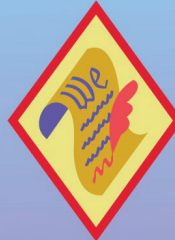
Democracy For Cadettes