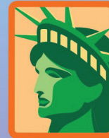
Democracy For Seniors