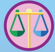
Democracy For Juniors