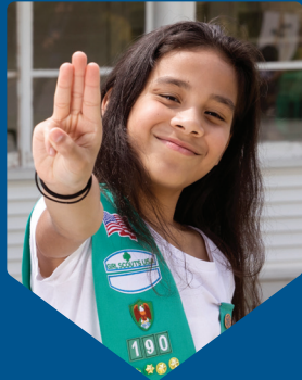
Displaying positive values