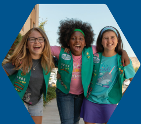
Forming and maintaining healthy relationships