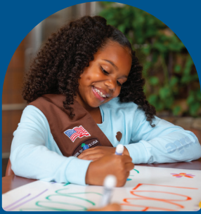
Developing a strong sense of self