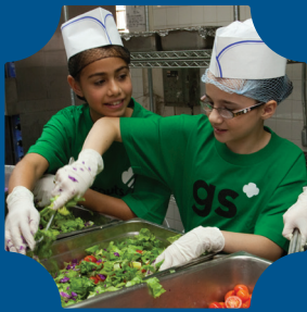
Identifying and solving problems in the community