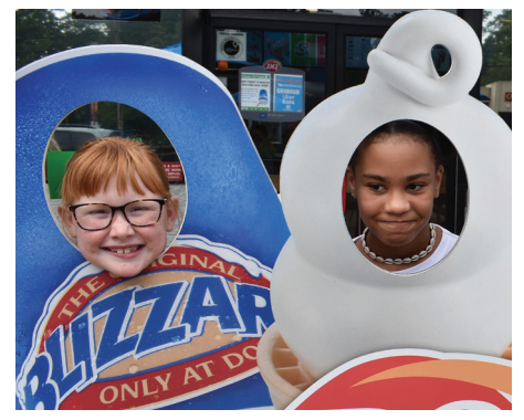
A partnership with Dairy Queen allowed GSCCC to host seven Meet & Treat events and connect with new Girl Scouts.