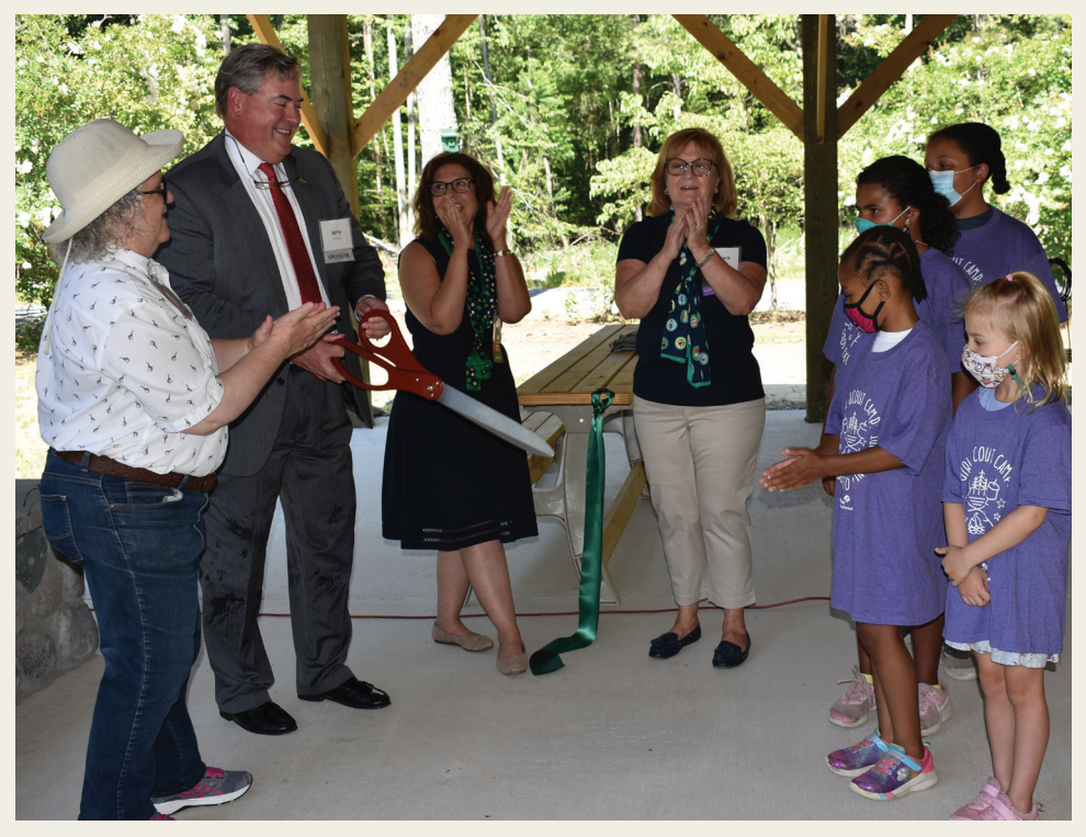
Thanks to supporters such as TowneBank, a new pavilion was added to Camp Skimino in 2021!