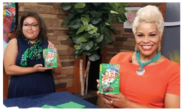
Media partners, such as WTKR, helped promote new aspects of the 2021 Cookie Program, such as the addition of Grub Hub for deliveru.

The Girl Scout 2021 Cookie Program gave girls opportunities to learn important skills such as goal-setting, decision-making, budgeting, communications and business ethics.