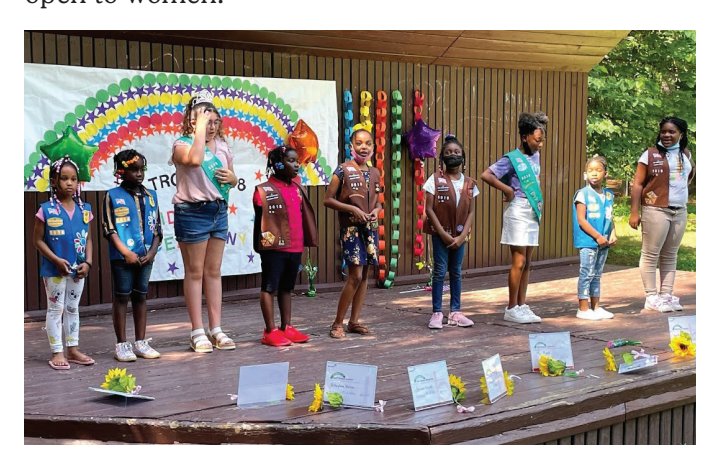
Community Troop 5018 from Thurgood Marshall Elementary had a special day at the Zoo for their bridging ceremony.

Community partners, such as colleges, universities, businesses and other nonprofits, were important in how we engaged girls. They supplied the expertise and knowledge needed to enhance badge work and connected girls to the real world. Thanks to partners, we've been able to bring subjects such as cyber security and coding to girls, helping them understand online risks and become aware of the wealth of STEM careers open to women.