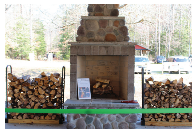
Dedication of the Ax Throwing Range and the Pavilion at Camp Darden was on March 7, 2020.