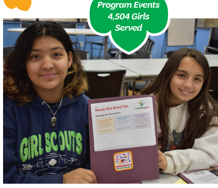
Girls gain the skills and the inspiration to accept challenges, overcome obstacles, and take the lead by exercising and staying healthy, developing strong relationships with family and peers, advocating on behalf of others, protecting our environment, and exploring careers that can truly change the world for the better. GSCCC offered a variety of program opportunities and workshops such as Brand Me, one that focused on relationship building and communications.