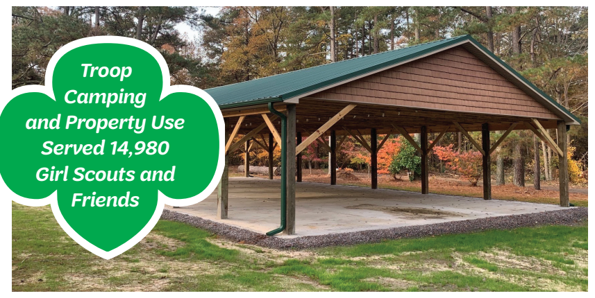
GSCCC continued to develop and maintain Council properties. A new pavilion was added to Camp Skimino in 2020.