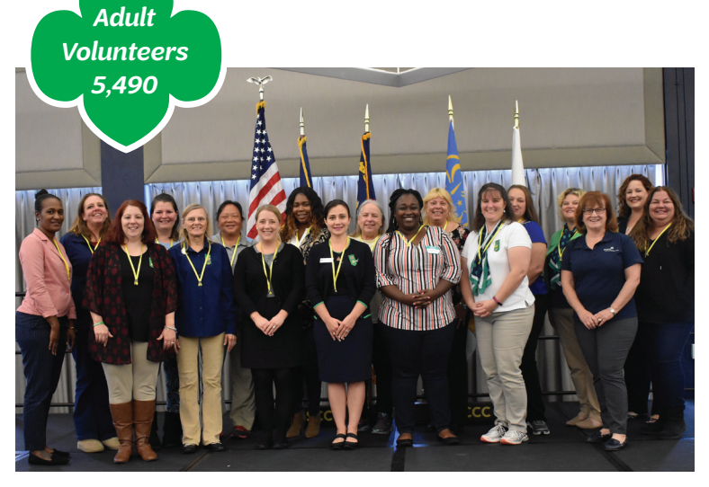
More than 200 volunteers attended the October 2019 Volunteer Kickoff. In the spring of 2020, GSCCC held a virtual volunteer awards celebration.