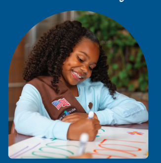
Developing a strong sense of self