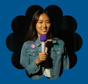
Seeking challenges and learning from setbacks