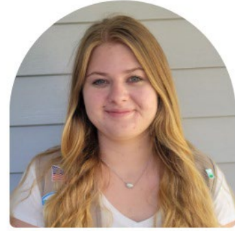
Gold Award: Reroot Our Agriculture