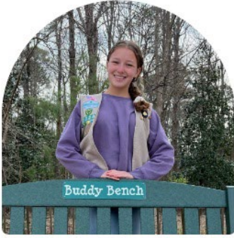
Silver Award: Buddy Bench