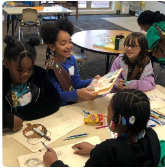
It's Your Story, Tell It!