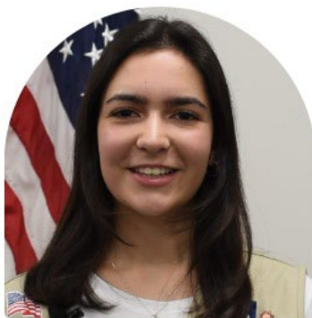
Gold Award: Eating Disorders