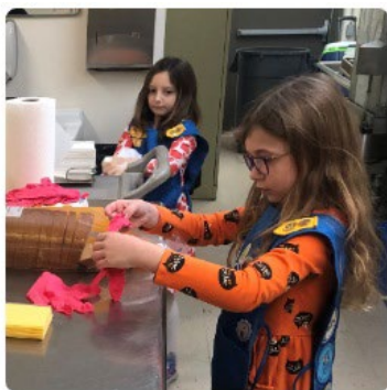
Acts of Service, Acts of Kindness

Graduating Girl Scouts have opportunities to receive scholarships for their continuing education. Applications are being accepted through May 1, 2024. Please visit gsc.org to learn more.