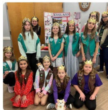
World Thinking Day