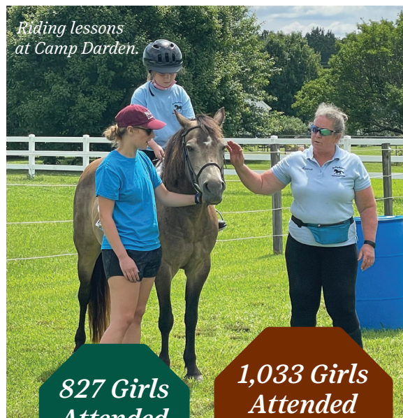
Riding lessons at Camp Darden.

Looking to the future, we will continue our Girl Scouts mission to build girls of courage, confidence, and character. We invite more friends in the community to connect with us, to become the volunteers we need to lead troops, facilitate adult classes, and govern the council, to be program partners we need to access expertise and knowledge for enhanced programming, and to be the supporters we need to gain critical resources to fund and support our council's work. Together we will provide the tools to girls to be leaders today and into the future.