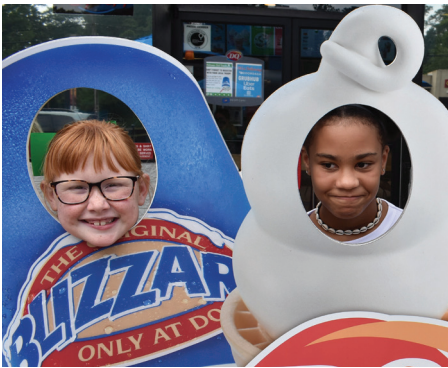
A partnership with Dairy Queen allowed GSCCC to host seven Meet & Treat events and connect with new Girl Scouts.