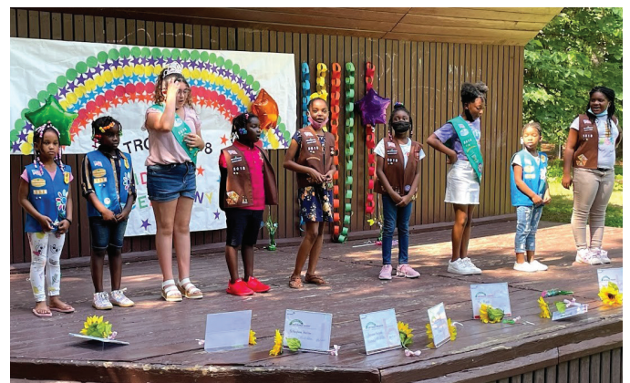
Community Troop 5018 from Thurgood Marshall Elementary had a special day at the Zoo for their bridging ceremony.

Community partners, such as colleges, universities, businesses and other nonprofits, were important in how we engaged girls. They supplied the expertise and knowledge needed to enhance badge work and connected girls to the real world. Thanks to partners, we’ve been able to bring subjects such as cyber security and coding to girls, helping them understand online risks and become aware of the wealth of STEM careers open to women.