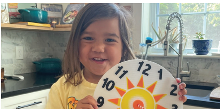
Community Troop Team was able to distribute Badge-in-a-Box kits through the help of partner agencies. The kits included many STEM badge activities that allowed girls to do hands-on fun at home where they made things such as their own sun dials.