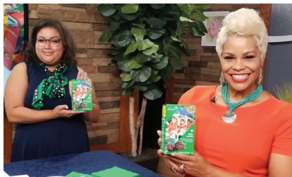
Media partners, such as WTKR, helped promote new aspects of the 2021 Cookie Program, such as the addition of Grub Hub for delivery.

The Girl Scout 2021 Cookie Program gave girls opportunities to learn important skills such as goal-setting, decision-making, budgeting, communications and business ethics.