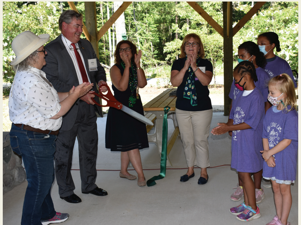
Thanks to supporters such as TowneBank, a new pavilion was added to Camp Skimino in 2021!